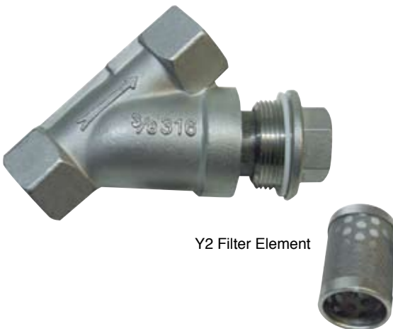
Y2 Filter Element