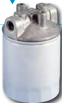
MODEL FEF-30 Element area 510 sq. in. Flows up to 25 GPM (return)