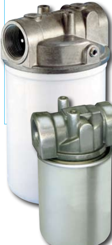
MODEL FEF-51 Element area 950 sq. in. Flows up to 60 GPM (return)